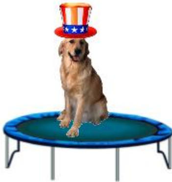
Max can jump.