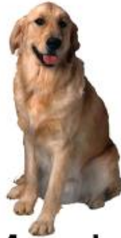
Max is big.