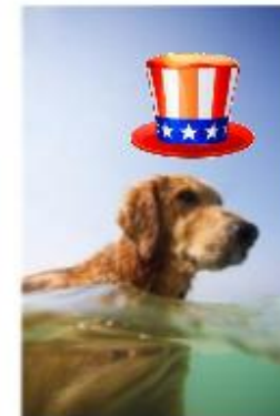
Max can swim.