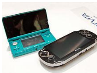
Nintendo or PSP

Work with a partner. You are Santa and an efl. Together, choose Christmas presents for your class. Use the phrases below to help you.