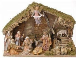
a nativity scene